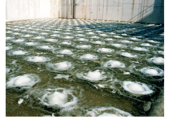
The membranes of ELASTOX®-T disk air diffusers consist of a special composition rubber (EPDM) or special silicone that have already proved their worth in many facilities.