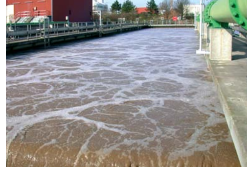
For effective aeration, all required properties must be taken into account, e.g. in terms of basin geometry and process technology.