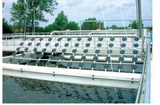
Removable aeration field with ELASTOX®-T disk air diffusers